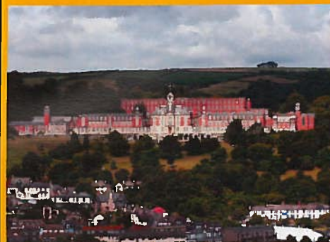
Britannia Royal Naval College